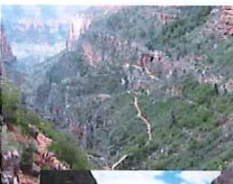
The Colorado River at the bottom of the Grand Canyon

Coby and I had the privilege to hike the Grand Canyon in May: from the north rim 24 miles to the south rim. We did it in a slow pace of 12 hours. We saw beautiful waterfalls, cliffs, condors and lots of sweat. We camped on the north rim in 28 degree weather. We saw hundreds of deer at camp. We hit the trail at 5am. We got snowed on and sun burned on the same hike. I'm so ready to do it again and do it faster. Who's with me?