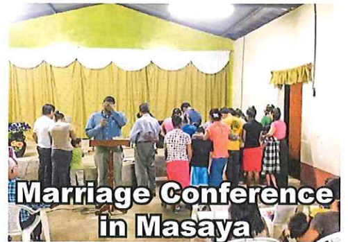
Marriage Conference in Masaya